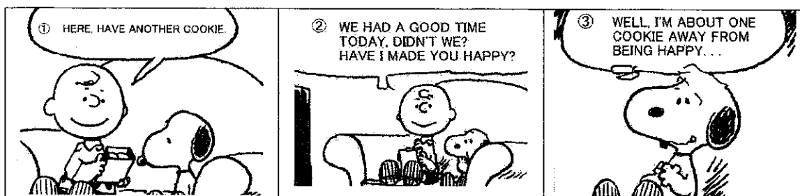
スヌーピー・ブックス『HAVE ANOTHER COOKIE(クッキー、もっといかが?)』(チャールズ M シュルツ)より